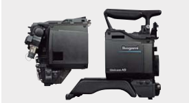
FA(Fiber Adaptor) or TA(Triax Adaptor)

With a docking style camera body, either an FA (Fiber Adaptor) or TA (Triax Adaptor) can be mounted depending on the use. Lower profile and lower weight improve the maneuverability for shoulder use.